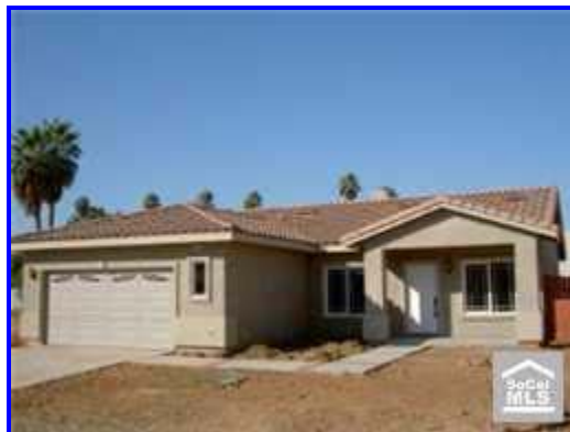
House Front at angle